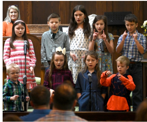
Children's Choir, November 20