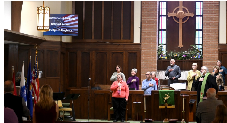
November 13, Presentation of the Flags