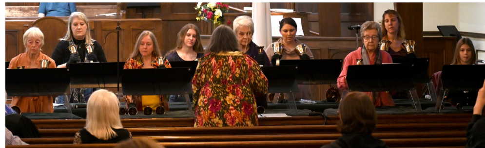
Agape Handbell Choir November 27