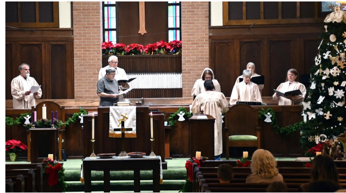
Chancel Choir January 2nd Anthem: "A Prayer of Blessing"