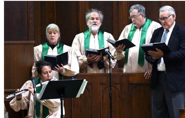
Choral Quartet January 9th