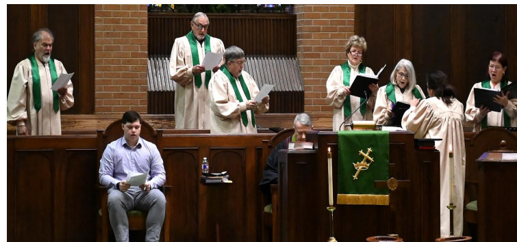
Chancel Choir anthem—Love Mercy & Grace January 30th