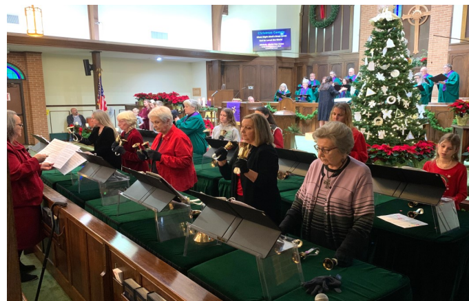
Agape Hand Bell Choir