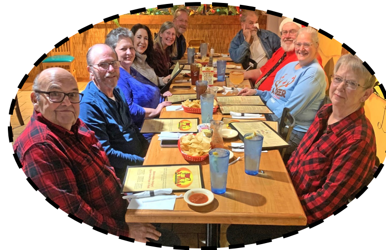
Staff Christmas Party