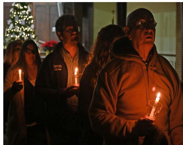
Christmas Eve Candlelight Service