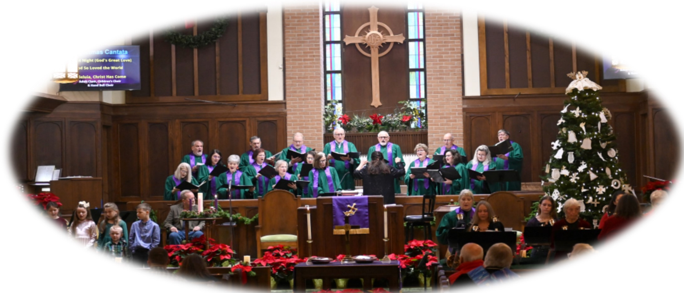
Christmas Cantata 2022 Chancel Choir, Children's Choir & Hand Bell Choir