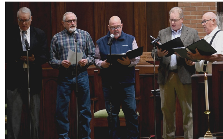
Men's Choir singing "Victory in Jesus"