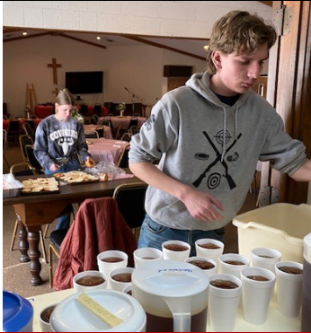
Prepping for the Luncheon