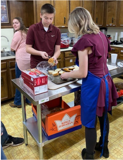
Prepping for the Luncheon.