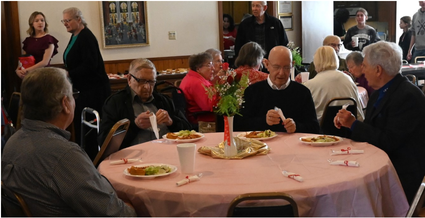
Several of our men enjoying the Spaghetti Luncheon