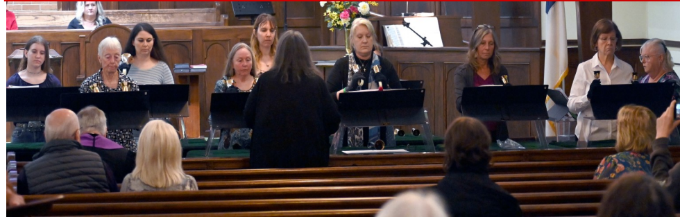
2/26/2023 Agape Hand Bell Choir , “Blessed Assurance”