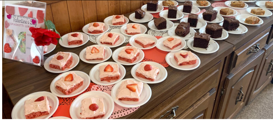
Lots and lots of deserts at the Spaghetti Luncheon.