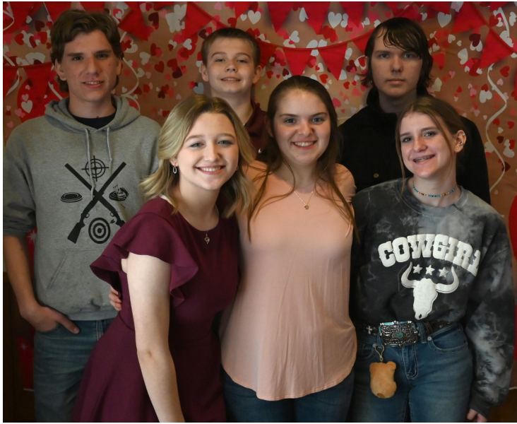
GREAT picture of Our Youth Group . They did an awesome job!!!