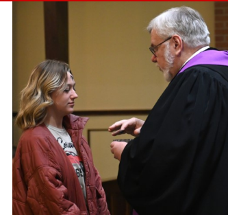
Ash Wednesday Service